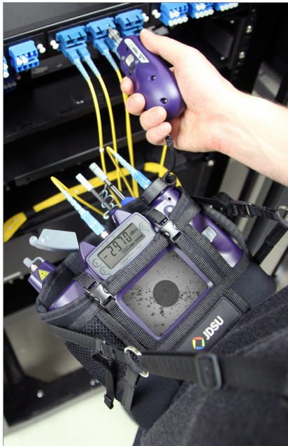
HP2-60-P4 shown with utility carrier and other tools.

The HP2 system, derived from the popular HD2 Series, provides high-quality image resolution in a compact, portable design. The integrated power meter offers quick, easy, and convenient field measurement of optical power and attenuation. Easy push-button operation makes the device simple and straightforward, while the inspect-test process establishes optimal workflow practices.