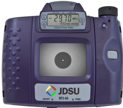
HP2-60-P4 Fiber Inspect and Test System with Integrated Power Meter and Patch Cord Microscope